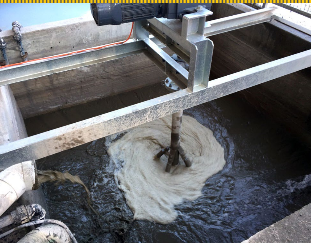
Recycle water stirrer

Manufacturer of Concrete Batching, Mining, & Quarrying, Blending & Asphalt Equipment