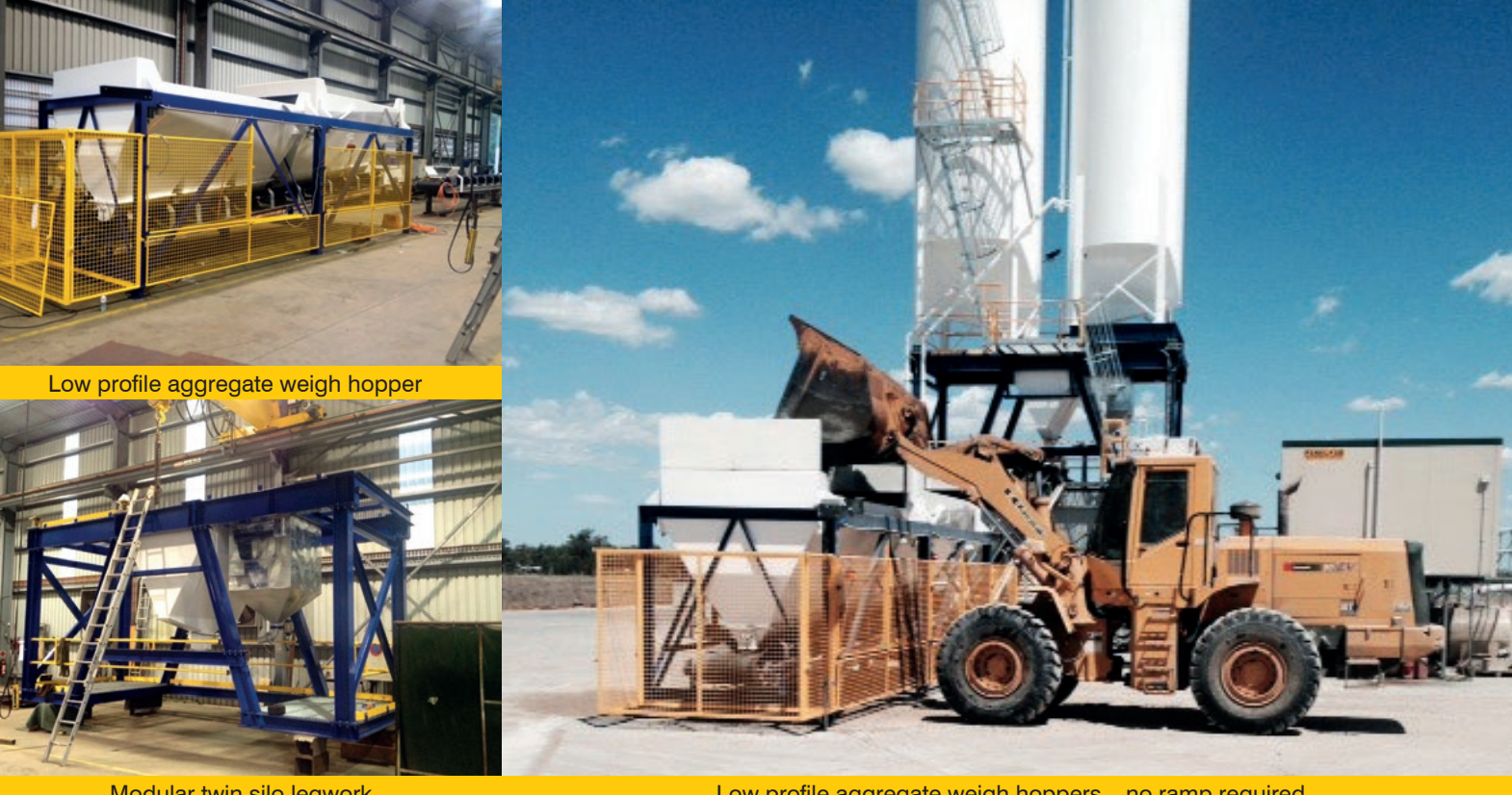
Modular twin silo legwork