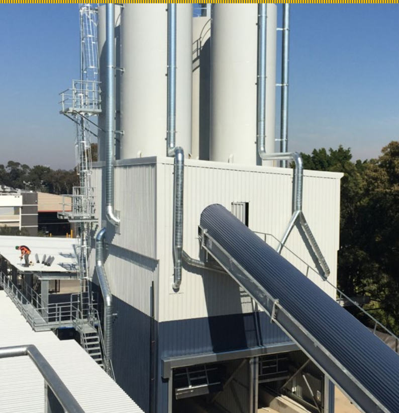
Gunlake Silverwater Plant

Manufacturer of Concrete Batching, Mining, & Quarrying, Blending & Asphalt Equipment