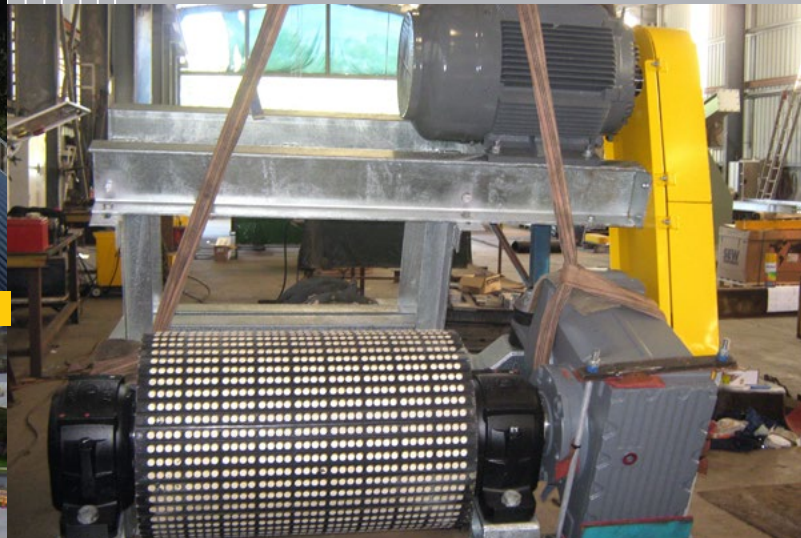
Ceramic impregnated head drum: eliminates belt slippage and greatly increases the life of the rubber lagging on the head drum