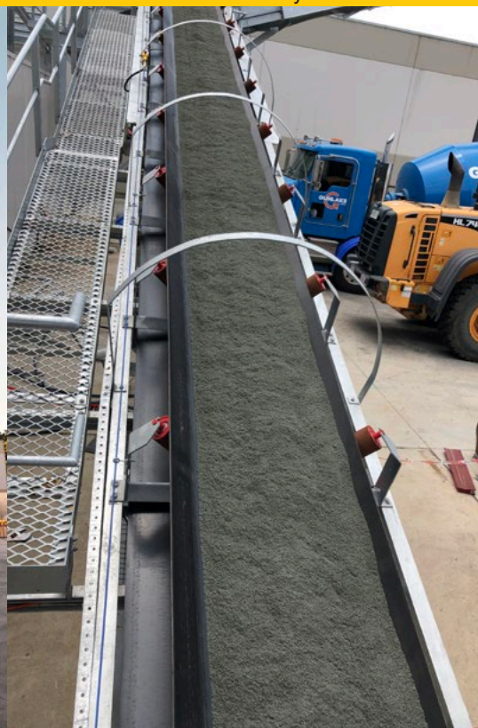
High capacity transfer conveyor