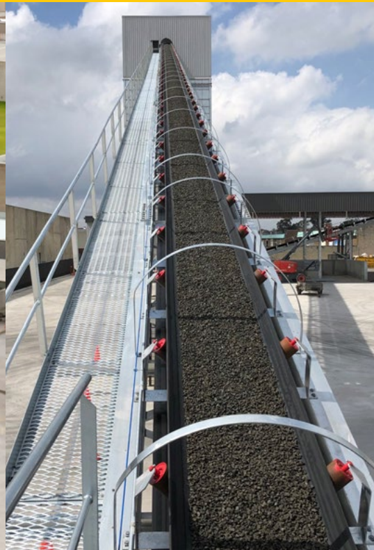
Typical CMQ conveyors