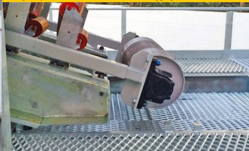
CMQ special screw take up where take up thread is not exposed to the elements. Used on conveyors less than 30M long.