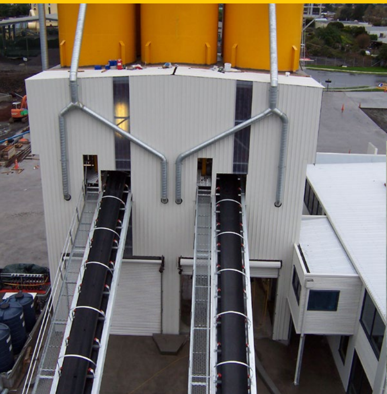
Allied NZ Plant