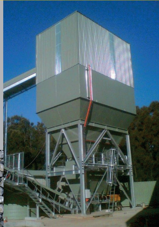
8-compartment 400T steel overhead storage bin with 2 aggregate weigh hoppers