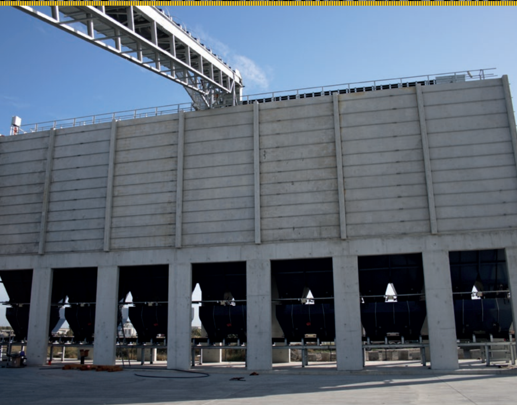
7-compartment 1750T concrete overhead storage bin with 7 aggregate weigh hoppers

Manufacturer of Concrete Batching, Mining, & Quarrying, Blending & Asphalt Equipment