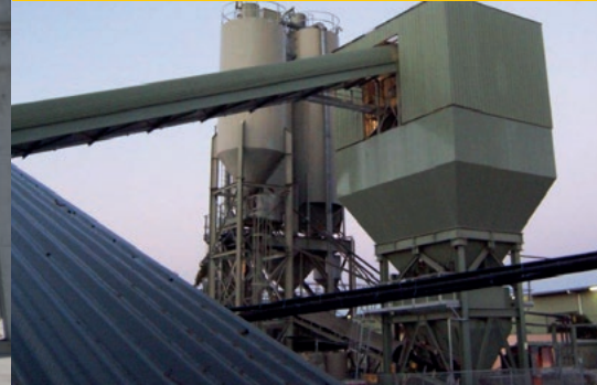
8-compartment 250T steel overhead storage bin with single aggregate weigh hopper