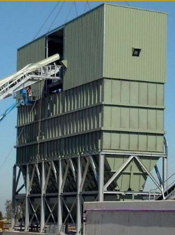
5-compartment 1000T steel overhead storage bin with 5 aggregate weigh hoppers

CMQ can custom design and fabricate cement or steel storage bins above ground or drive over storage to meet customers' requirements.