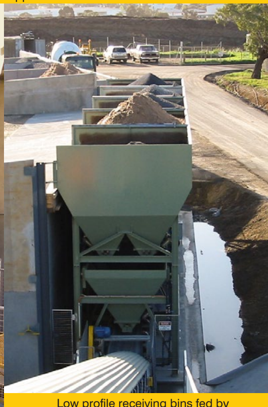
Low profile receiving bins fed by front end loader or truck