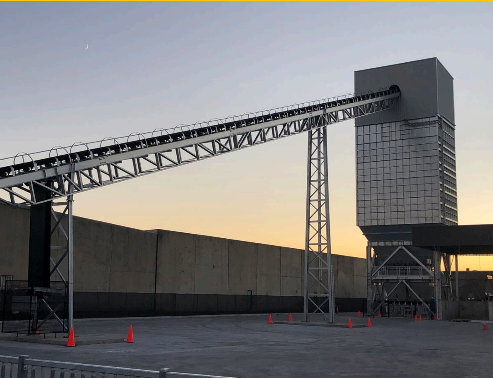
1000T overhead storage bin with dual aggregate weigh hoppers