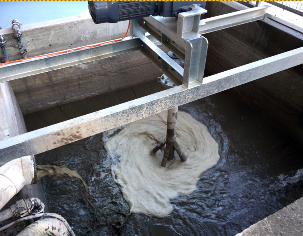
Recycle water stirrer

Manufacturer of Concrete Batching, Mining, & Quarrying, Blending & Asphalt Equipment