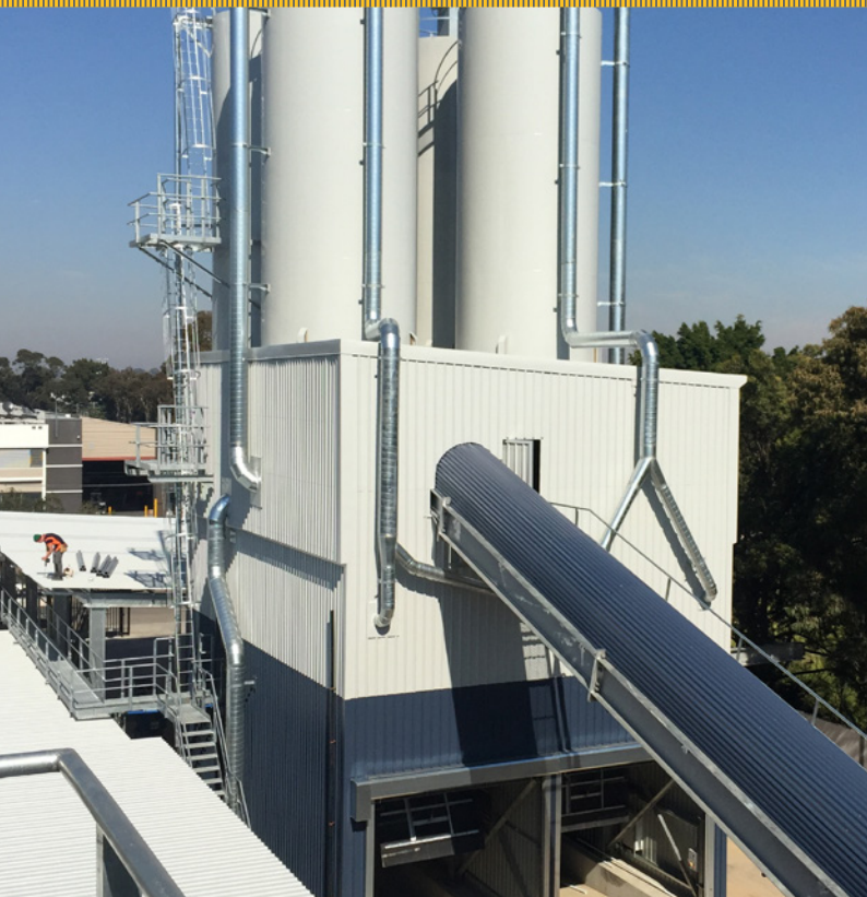
Gunlake Silverwater Plant

Manufacturer of Concrete Batching, Mining, & Quarrying, Blending & Asphalt Equipment