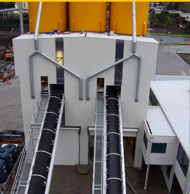
Allied NZ Plant