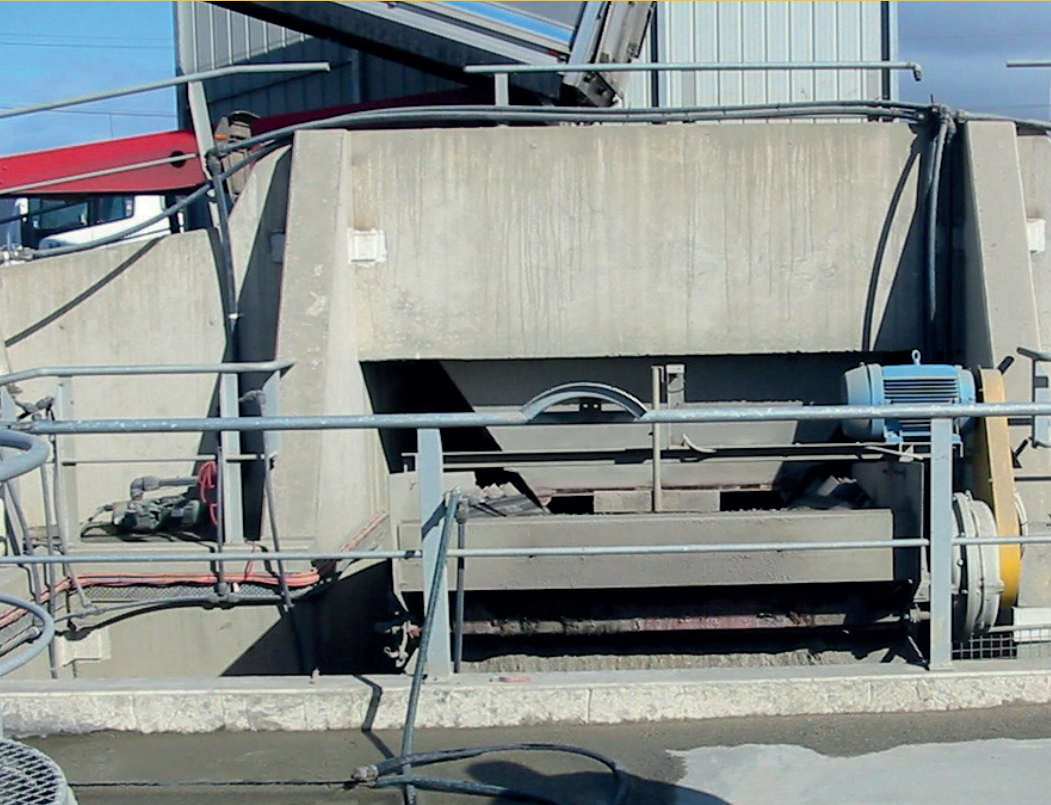
Truck unloading onto feed belt

CMQ's truck unloaders have been purposely designed for sites that have limited truck access or high water tables, for the benefit of limiting the amount of room and excavation required.