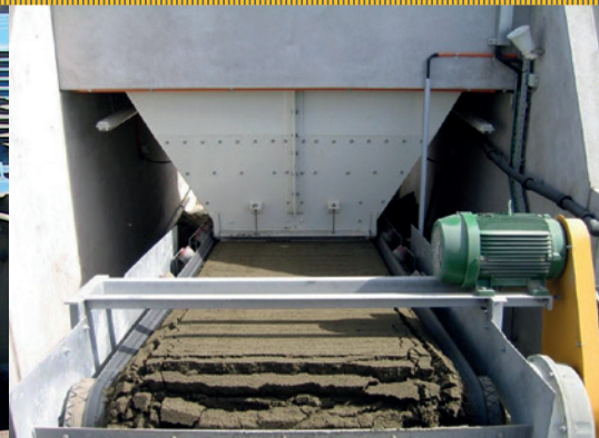
Sand feeding onto discharge conveyor