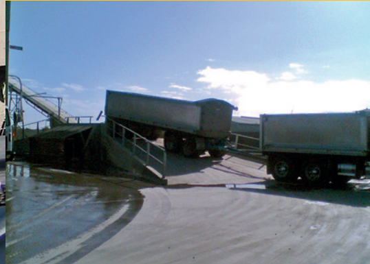
Typical low weight truck unloader plant