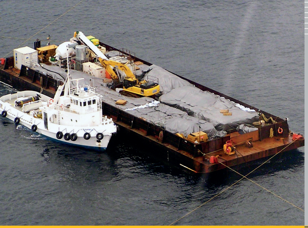
Barge being poistioned offshore at Tugun, QLD Australia

CMQ is known for producing customised designs catered for specialised and challenging projects, such as the Tugun Desalination Project.