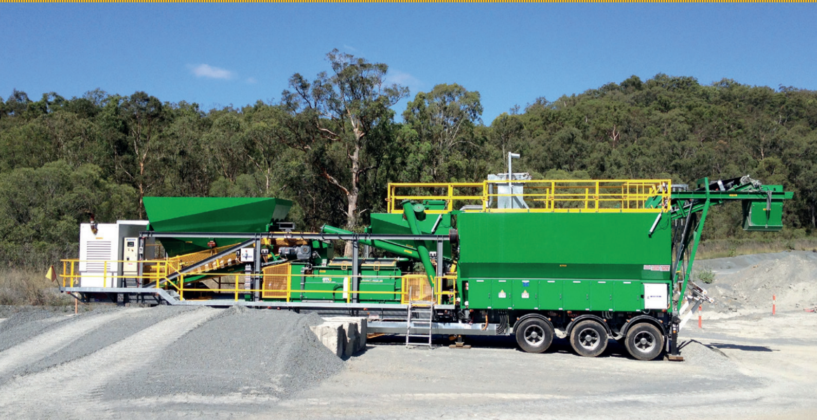
Mobile backfill paste plant

Manufacturer of Concrete Batching, Mining, & Quarrying, Blending & Asphalt Equipment